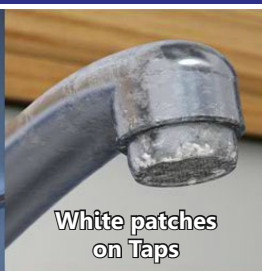
White patches on Taps