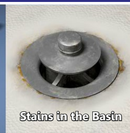
Stains in the Basin