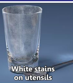
White stains on utensils